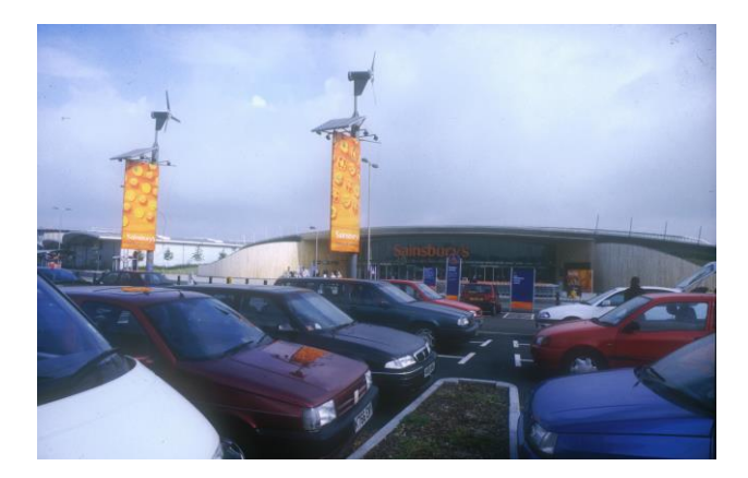
Figure 1: Sustainable tokenism, wind turbines in a sea of car parking

Consequently, when the design process operating within most Western economies is considered, the major effort goes first into achieving the functional requirements of the client - within the economic constraints set by the budget. Second, to a concern for the visual, contextual and social impact of the development - to the extent that it is either financially prudent or a requirement brought about by public intervention in the design process. Last (usually) it will focus on broader environmental concerns which tend to feature poorly in both private and public agendas, and responsibility for which is frequently highly fragmented (Carmona & de Magalhaes 2007, pp60-62). The result can too easily be a token engagement with sustainability, rather than a serious attempt to reflect a more holistic sustainable urban design agenda (Figure 1).